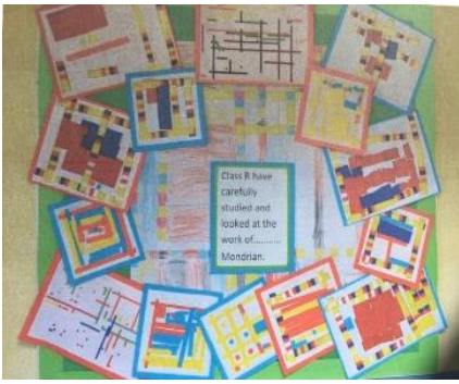
YR looked at work by Mondrian and observed pattern and shape