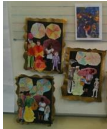
Work by Yr4 based on the National Gallery's 'Take One Picture' project.