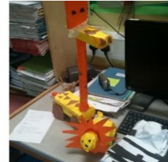
3-D Models from Year 2 based on The Great Fire of London and African Animals