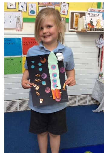
Whole School Art Day