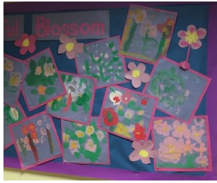
Observational paintings of Spring blossom.