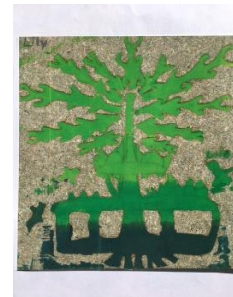
Perspective drawing skills, self portrait and relief printing block by Yr6

At Churchill C.E.V.C. Primary we value the important role that art and design can play in response to a variety of local community and national events. Every year children take part in a competition to design a front cover for the village leaflet advertising the Christmastime church services, and the Doctors Surgery, which is just over the road, has artwork from our children hanging in it's waiting room. Special events like the Remembrance Day Centenary and The Olympics are celebrated through whole school art and design projects, and are displayed in our public spaces, serving as vibrant focal points which bring our school community closer together. Classes have taken trips to Bristol Art Gallery, Portishead Sculpture Park and the local parish churches of St. Mary's and St. John's to observe stained glass windows and brass rubbings.