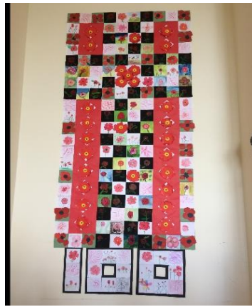
Each child in our school designed a poppy for the Remembrance Day Centenary hall display.